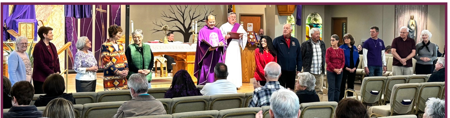
Below: The Ministry Fair Representatives are recognized for their service